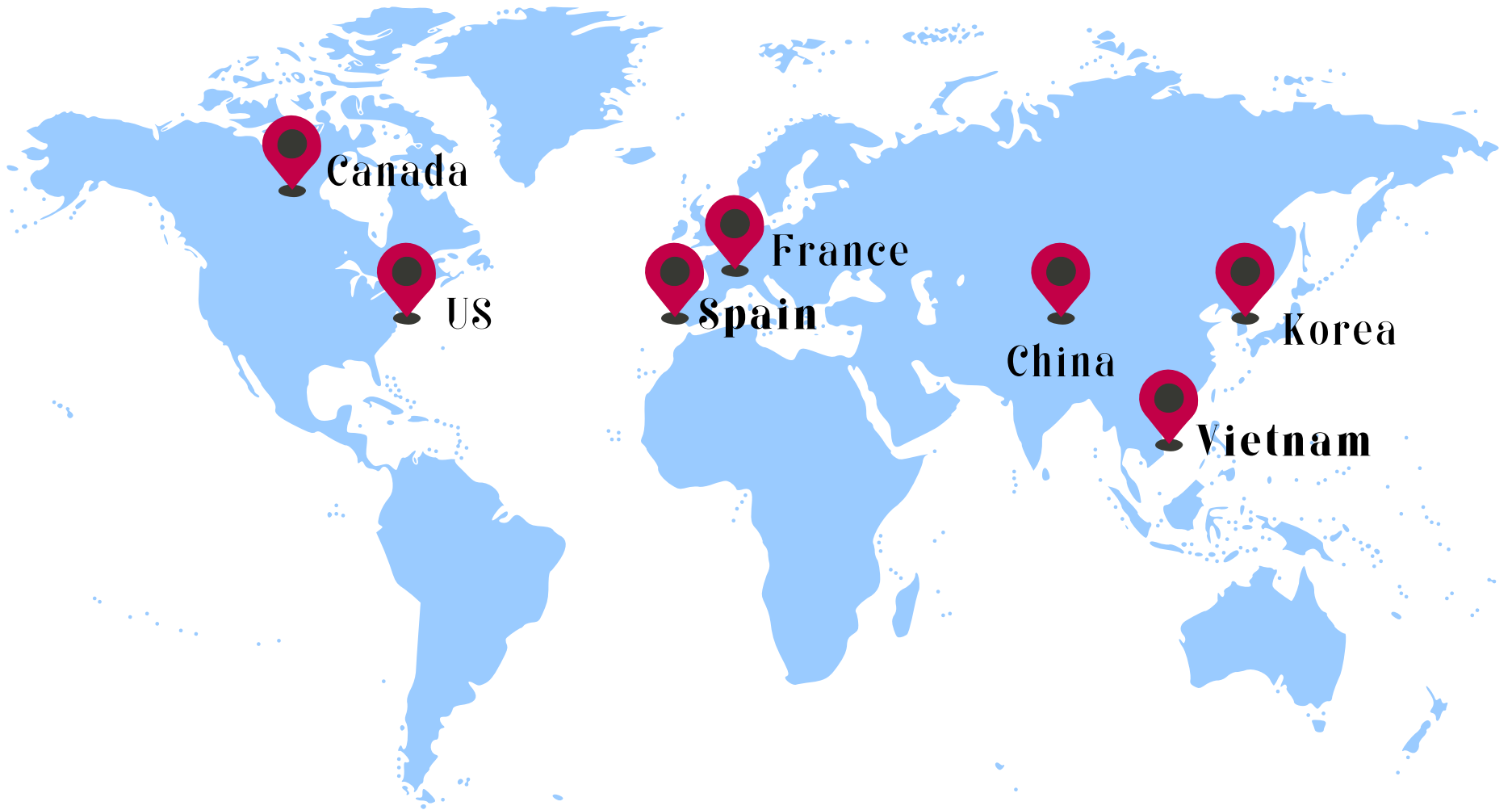
FASMPO's countries distribution map